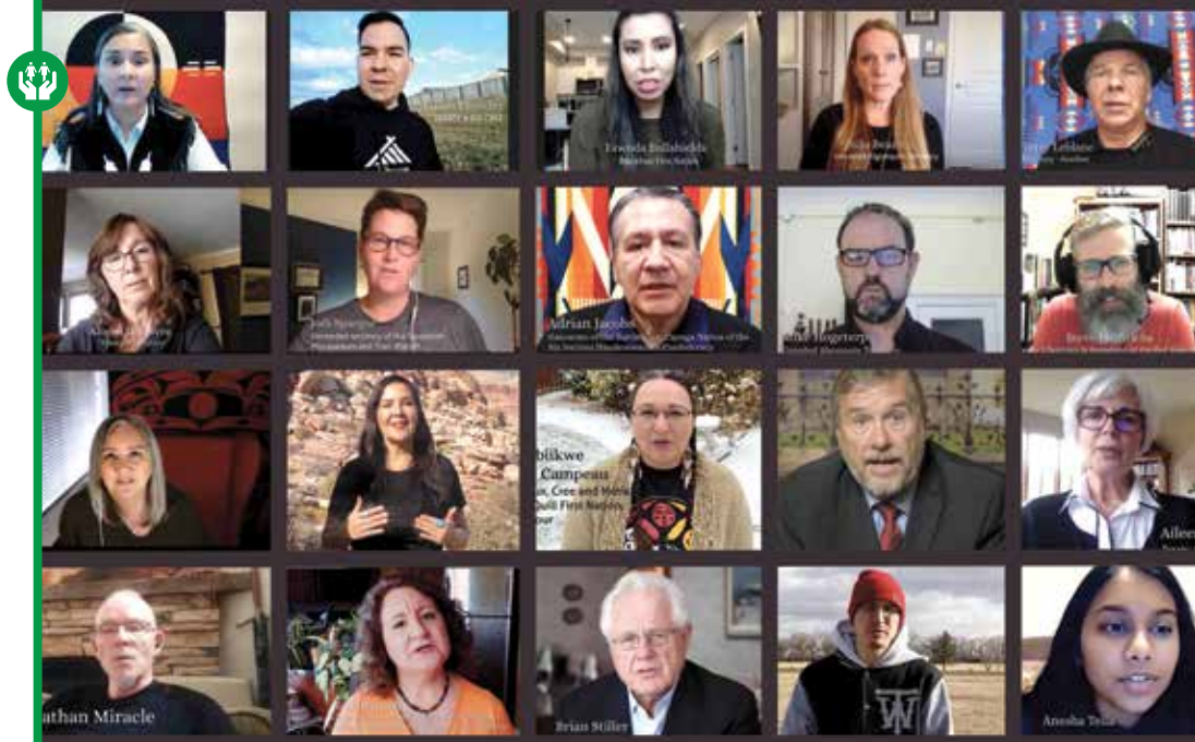
Participants in the Reconciliation Proclamation initiative

> Join us in protecting the rights of medical professionals.